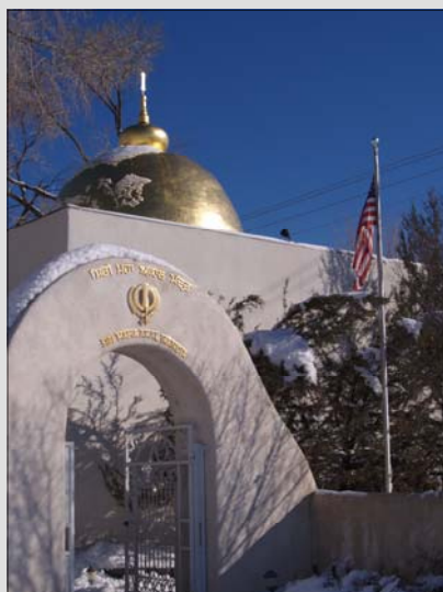
First snow of the season!